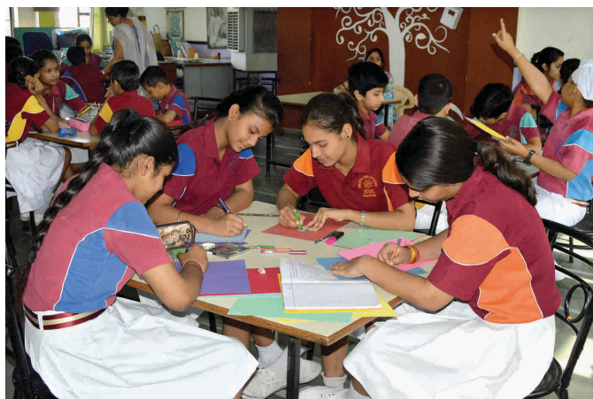
Students Honing their Creativity at Library