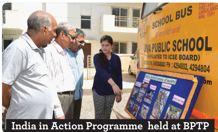
India in Action Programme held at BPTP