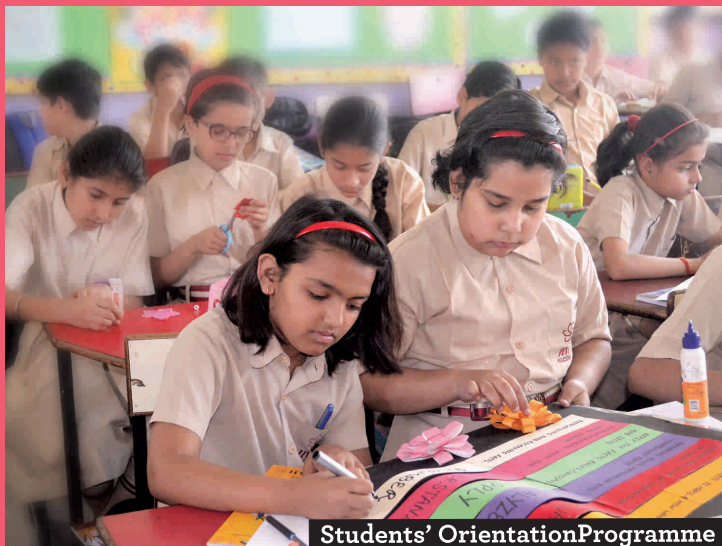
Students' Orientation Programme