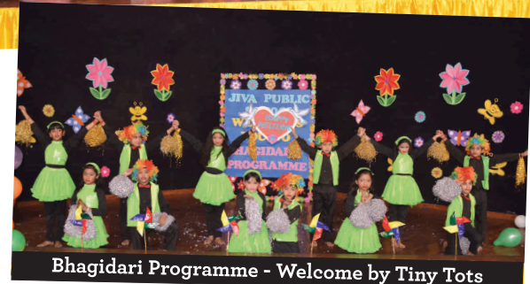
Bhagidari Programme - Welcome by Tiny Tots