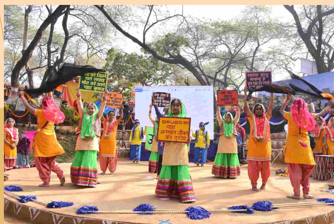
Message by Jivites at Surajkund Mela