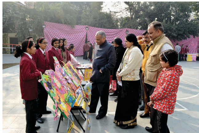
PTM - Library Activity