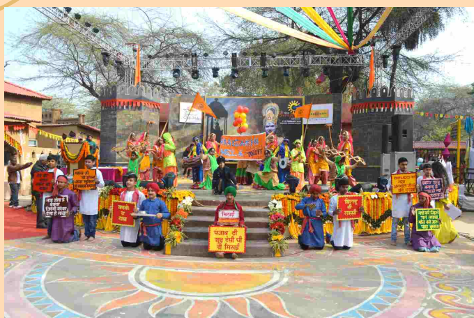
Message by Jivites at Surajkund Mela