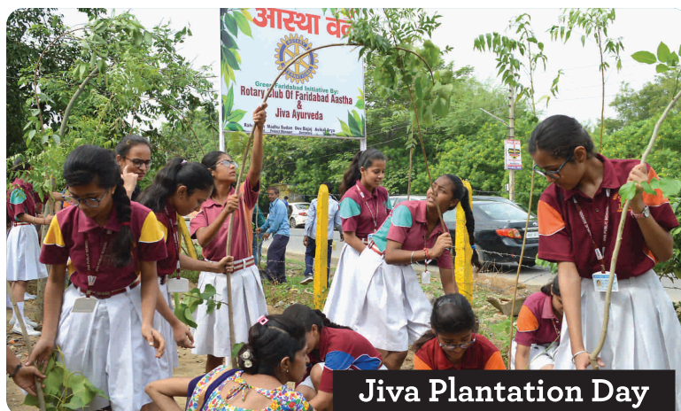
Jiva Plantation Day