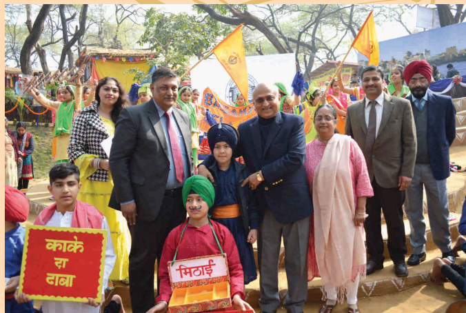
Guests at Surajkund Mela