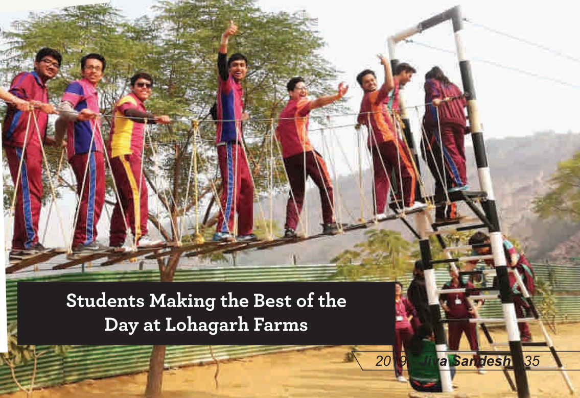
Students Making the Best of the Day at Lohagarh Farms