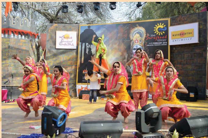
Colourful Performance by Jivites at International Surajkund Mela