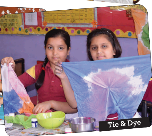
Tie & Dye