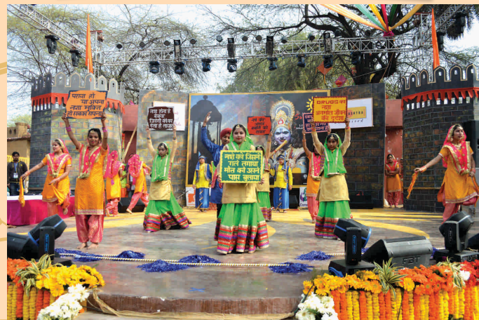
Message by Jivites at Surajkund Mela