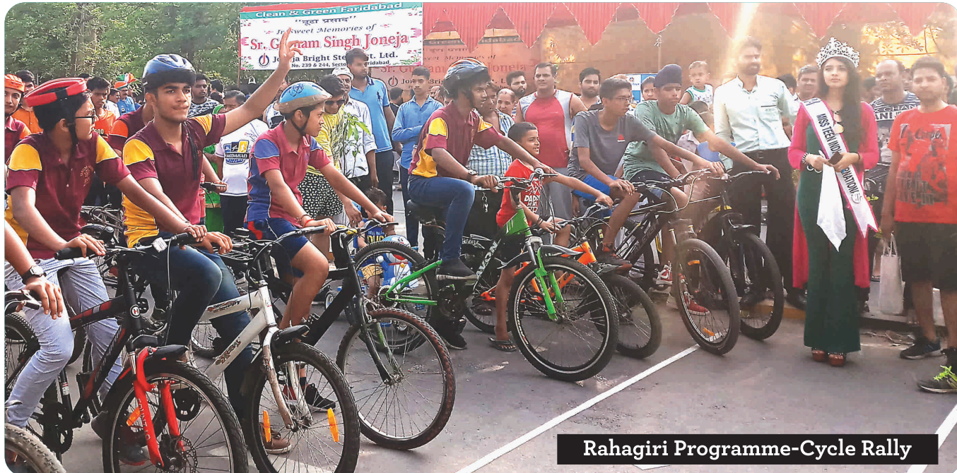
Rahagiri Programme-Cycle Rally

Being a part of India in Action Programme has been quite enriching for me. I, along with my friends have been to various public parks and have spread awareness about safety measures, wearing seat belts, helmets etc. I felt proud when an elderly man appreciated my initiative and also enquired the name of my school.